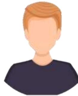
The FEMA Gyani