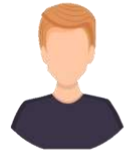
The FEMA Gyani

As per RBI's FAQ No.22 dated 06.04.2023- In a sole proprietorship business, there is no legal distinction between the individual / owner and as such the owner of the business can remit USD up to the permissible limit under LRS. Therefore, if an individual in his own capacity remits USD 250,000 in a financial year under LRS, he cannot remit in the capacity of owner of the sole proprietorship business again.