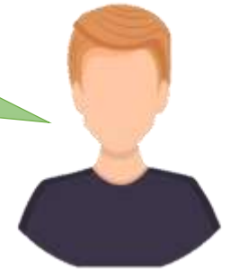
The FEMA Gyani