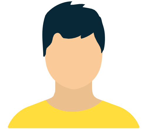
The FEMA Gyani

AD bank may permit change in name only of LO/BO if there's no change within the ownership of foreign company. However, if the change in name is only due to merger/acquisition/change in ownership of the parent company, then the closing of existing LO/BO shall be required.