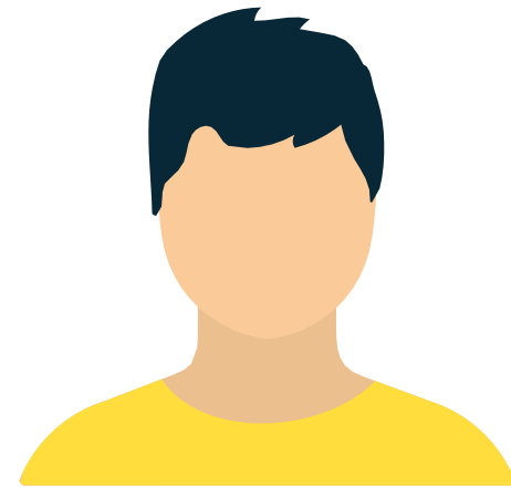
The FEMA Gyani

Hi FEMA Gyani!! Although I understood a lot about LO/BO/PO however there are some residual queries that I wanted to clear, so I will begin one by one . My first query is what if I want to transact through more than one bank account or I want to change my bank account is it permissible ?