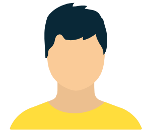
The FEMA Gyani