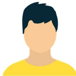
The FEMA Gyani

One more thing! The invoices raised on overseas client will be subject to valuation of export declared on SOFTEX form by designated official concerned of the Govt of India and consequent amendment made in the invoice value, if necessary.