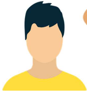
The FEMA Gyani

Software exporters have to report their export in form SOFTEX .