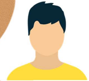
The FEMA Gyani

Although there is no clarity on the same, it is advisable that you should fill the form SOFTEX in case of export of software services, as in the softex form, code needs to be mentioned. And in code 909, it is mentioned Other type of Exports which may include export of software services.