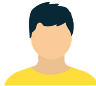
The FEMA Gyani

For long duration contracts involving series of transmissions, the exporters should bill their overseas clients periodically, i.e., atleast once a month or on reaching the milestone as provided in the contract.